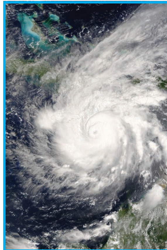
Satellite Photo: Hurricane Ivan moving westward through the Caribbean. September 2004