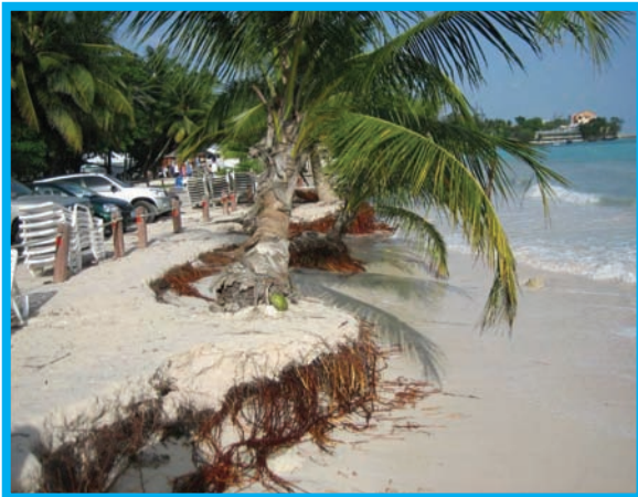
Beach erosion at Worthing Beach, Barbados.