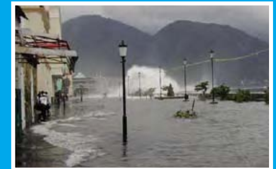
Storm surge, Hurracan Lenny, Roseau Dominica.

The elevation of the coastline significantly influences the kind of damage to buildings. In low-lying coastal areas with beaches, damage from storm surge is likely to result causing beach erosion that undermines foundations. The level and rate of erosion that is being observed may be used to inform the "safe" distance from the shoreline, up to which buildings may be constructed without fear of sea damage. Build your home a safe distance away from riverbanks, drains and the beach to minimize the impact of storm surge. Build your house on columns to prevent sand and water from storm surge and flooding rivers from getting into your house.